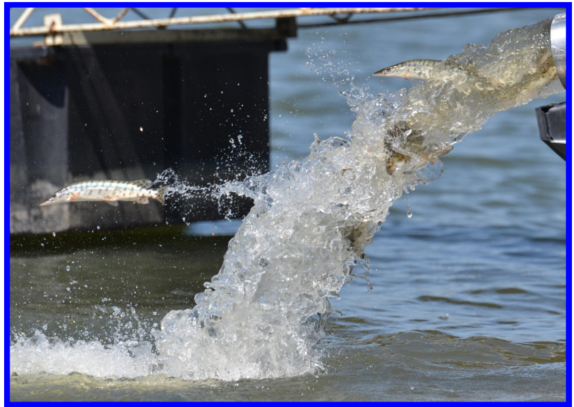
320 yearling Muskellunge stocked at West Lake Osceola this spring.

We found Yellow Bass at Three-Mile Lake during a fish survey in the fall of 2017. We are still moving forward with the restoration project, but need to make some adjustments to address the yellow bass issue. We usually stock yearling Muskies (6-12 inch fish) since they survive better than fingerlings. We had planned to stock yearling Muskies at Three-Mile Lake this past spring, but decided to hold off on that stocking and move it to West Lake Osceola. West Lake Osceola is a 320-acre lake just off I-35 in Osceola. The lake's flooded timber habitat, especially around the shoreline and main lake points, should make a good home for Muskies. We stocked 320 Muskies this spring, but it will take several years before they reach trophy size.