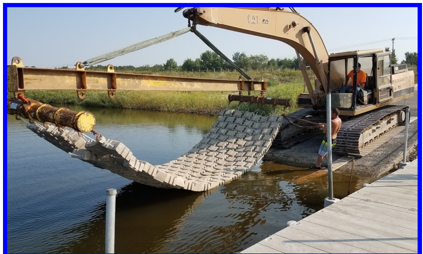
The west boat ramp lane at West Lake Osceola was extended this summer through the addition of sections of ArmorFlex concrete pads.

A contractor was hired to place sections of ArmorFlex concrete pads at the end of the current concrete ramp to extend it. This project was funded through the DNR's Marine Fuel Tax fund. The City of Osceola Parks and Recreation Department also bought new docks this year, so this area should be ready for boaters. While the improvements to the boat ramp will help make this area more accessible, boaters need to remember that using the boat ramps is at their own risk.