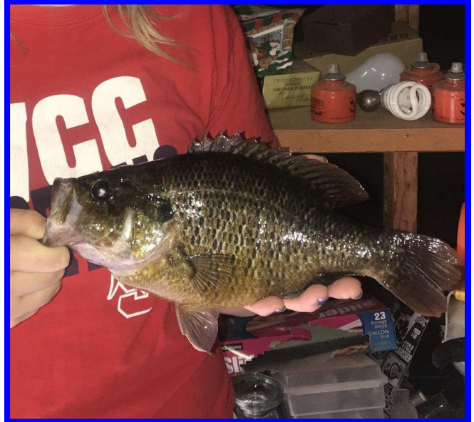
NEW state record Warmouth caught in spring 2018.