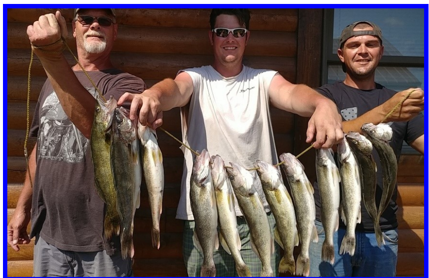
Three happy Walleye anglers after a day on Three-mile Lake.

Don't miss this opportunity to put some delicious Walleye fillets in your freezer before the cold Iowa winter settles in.