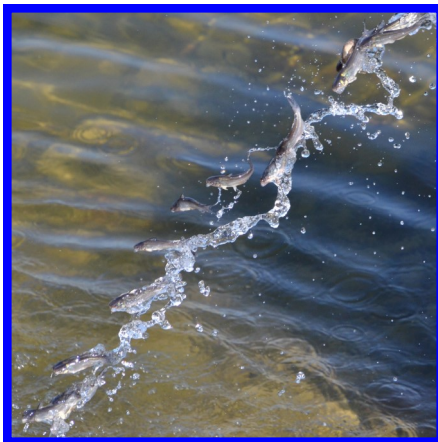
Bottom Left: Fingerling Blue Catfish stocked at Three-Mile Lake in 2017