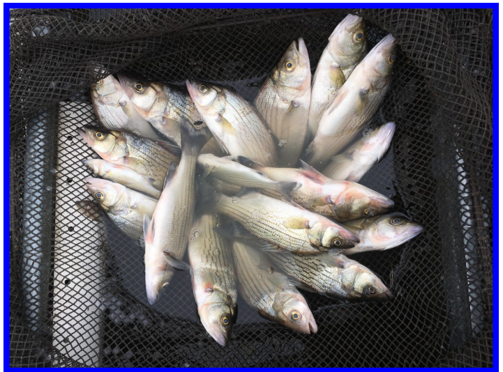
Hybrid Striped Bass (aka Wipers) like these from RAPP Park can put up a big fight for anglers.

If you're lucky enough to win the battle with a Wiper and want to harvest the fish, remember these considerations. First, put your catch on ice as soon as possible to keep the fish fresh. Wipers are often caught mid-summer when the air and water temperatures are warm. When you fillet the fish, you will see a red stripe down the center of the fillet. This is red muscle the fish uses for burst swimming and is filled with blood. Cut out that red strip of muscle before you soak your fillet in your favorite fish batter and introduce it to the cooking oil. The red muscle can give the fish an off-flavor that some people do not find pleasing.