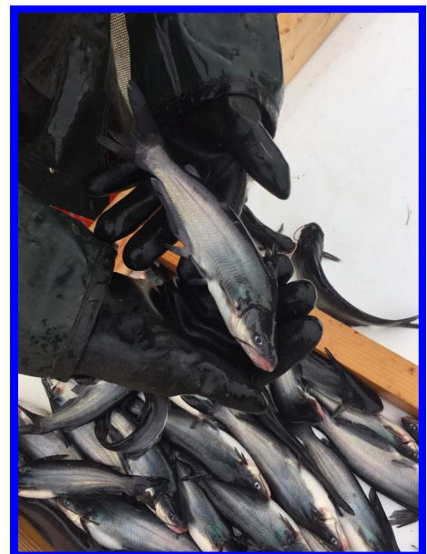
Blue Catfish raised at the Mount Ayr Fish Hatchery in 2018.