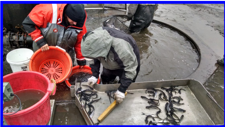
Top Left: 2016 Blue Catfish harvest at the Mount Ayr Fish Hatchery

We've really enjoyed raising Blue Catfish at our facility. We've had the opportunity to meet some great staff from other natural resource agencies and learn the techniques to successfully raise Blue Catfish. It's been a lot of fun and we hope to continue to raise Blue Catfish at our facility and continue to evaluate the introduction into Three-Mile Lake.