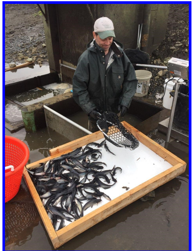
Right: 2018 Blue Catfish harvest at the Mount Ayr Fish Hatchery