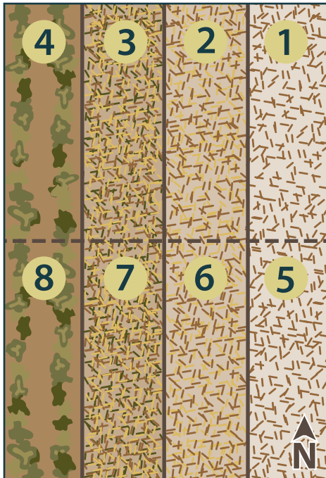
diagram 1: orientation and management of dove food plot

Consider managing half the plot for opening weekend and half for late season hunting as shown in Diagram 1.