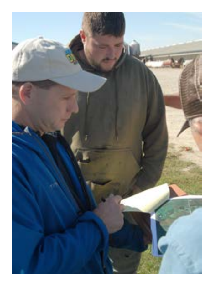
Inspecting, explaining complex rules or responding to a complaint—all in a day's work—as DNR environmental specialists help people meet state regulations.